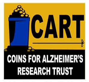
A Project of the Rotary Clubs of North America