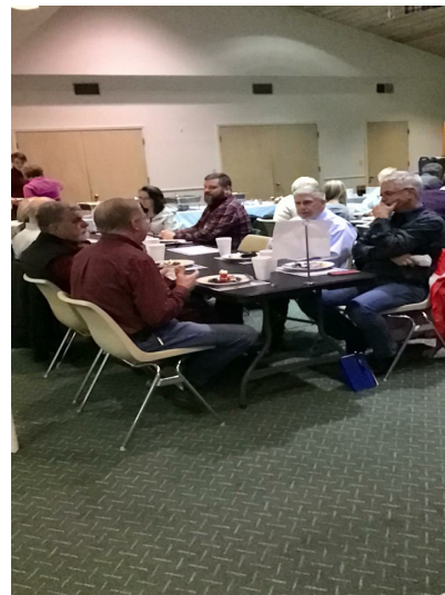
Youth Services Committee